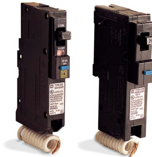
QO Circuit Breaker HOM Circuit Breaker