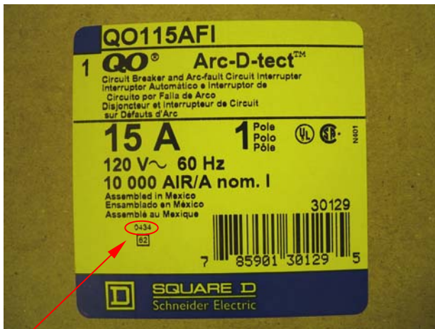
Carton Date Code